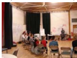
Dynamix in action at Stackpole

Some of you had some great idea's about getting our voices heard but we need to look at how we are going to do these things and it will still need a lot more work. The network reps discussed what the most important issue is for disabled young people and the overall message from the young people involved is that they